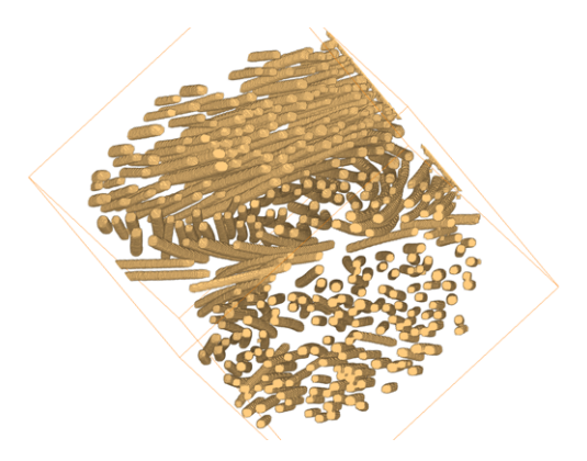
Figure 2. 3D visualisation of the segmentation method result.

To improve on the accuracy of the fibre border detection, a second pass can be performed, using for instance watershed [2] or interchangeably continuous maximal flows [1].