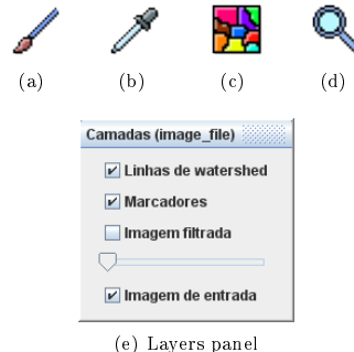
Figure 1. Some of the tools available: (a) Brush/Eraser (b) Color selector (c) Segment (d) Zoom (e) Layers panel

To allow the user to make small markers, in order to precisely segment detailed regions, it is also available a Zoom-in/Zoom-out tool, shown in Figure 1(d).